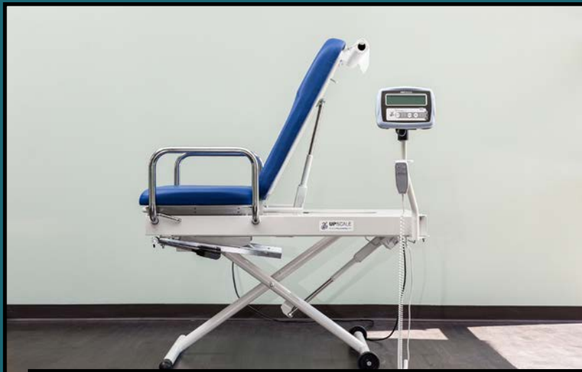
Example of adjustable exam table & scale