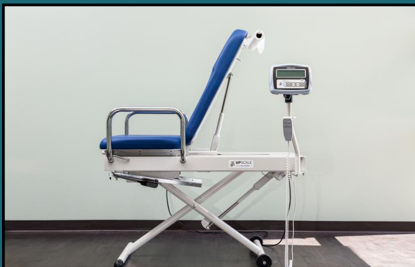
Example of adjustable exam table & scale